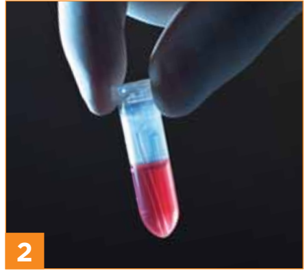
Place capillary into cup and invert until mixed.

Collect 20 \mu l blood sample in capillary.