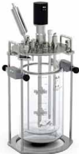
For example HABITAT ferment dw 5 for 5 liters

Now you can complete your control unit package with the matching vessels: In addition to the control unit package, you order the matching vessel package according to your application and your working volume. And you're ready to go.