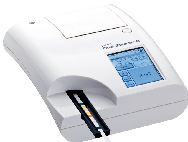
DocUReader 2 Pro Compact Urine Chemistry Analyzer