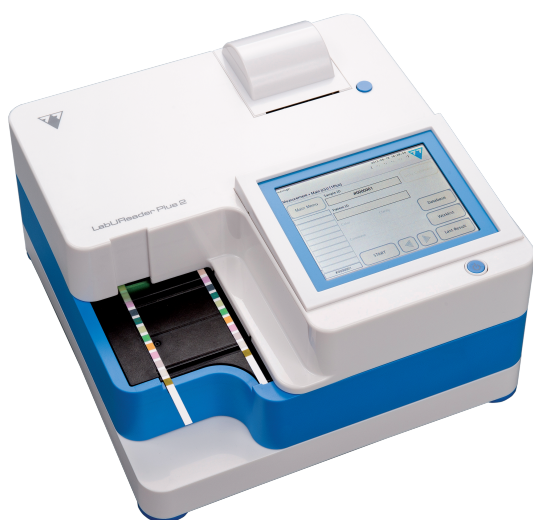
LabUReader Plus 2 Semi-automated Urine Chemistry Analyzer