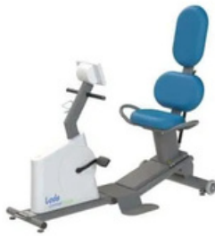
Corival recumbent rehab