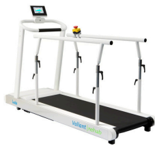
Valiant 2 rehab Valiant 2 rehab XL