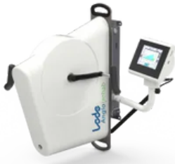
Angio static wall fixation