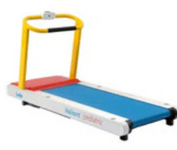
Valiant 2 pediatric