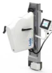
Angio electrical adjustable wall fixation