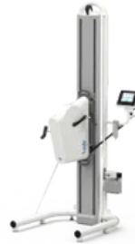
Angio automatic stand