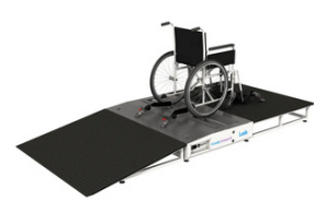
Esseda wheelchair ergometer