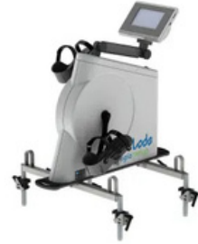
Angio fixation set