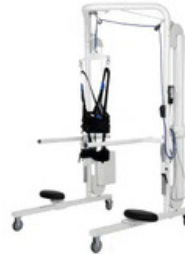
Body weight support system