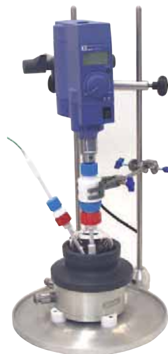
Breeze with 250ml Heat-On, stand and overhead stirrer