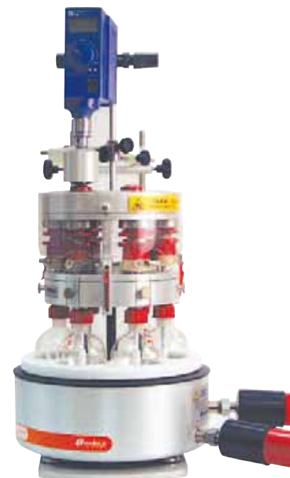
Storm with Carousel 6, Tornado, overhead stirrer and PTFE insulating plate