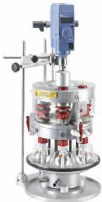
Breeze with Carousel 6, Tornado and overhead stirrer