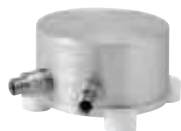
Breeze Work Station