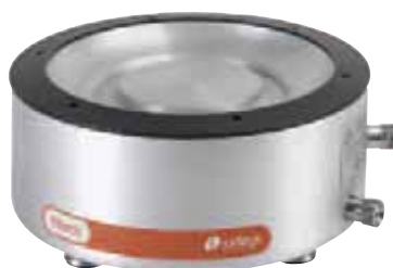
Storm Work Station