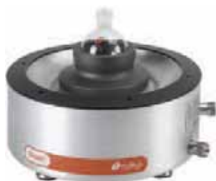
Storm with a 250ml Heat-On block